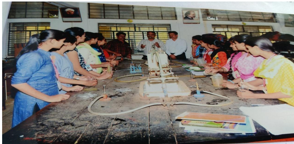
Practical session being conducted